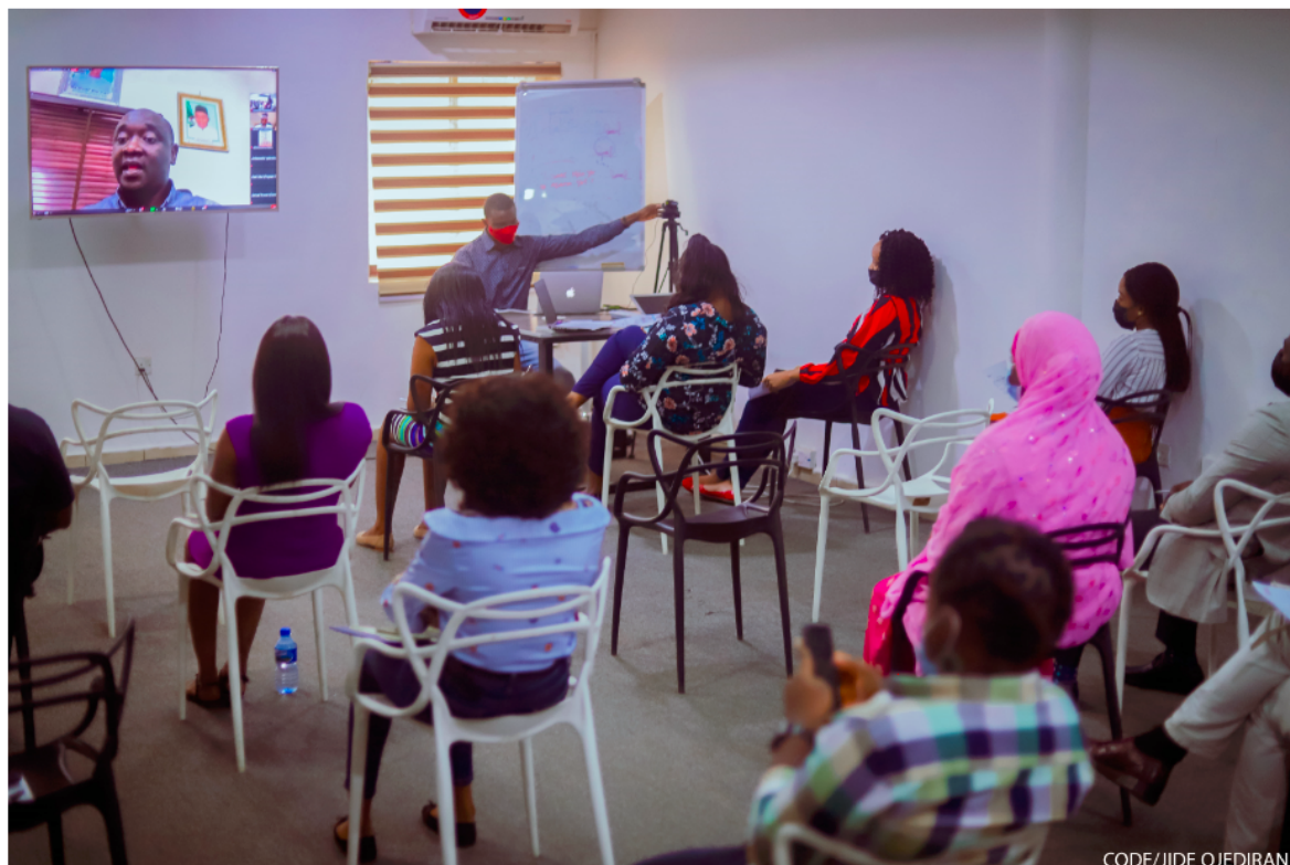
Cross section of on-ground participants at the viewing center during a virtual presentation by the Hon. Commissioner, Samuel Aruwan (on screen above)