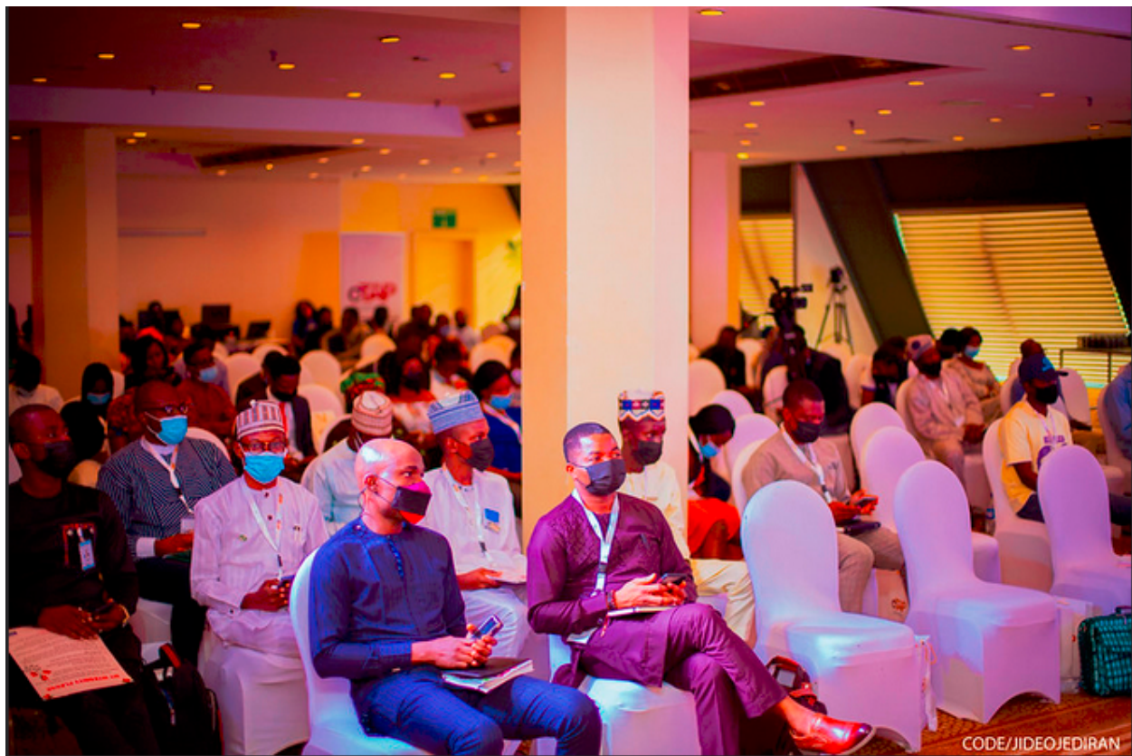
Cross section of participants during CTAP conference at Transcorp Hilton

On 22nd of April, 2021 Follow The Money (FTM) & BudgIT organised an audacious COVID-19 Transparency and Accountability Conference with over 150 in-hall participants and 5000+ virtual audience. The event that hosted Government Representatives, Civil Society Organisations and Citizens, discussed grey areas in the COVID-19 intervention spending by the Nigerian government. The Minister of State for Budget & National Planning, Prince Clem Agba, acknowledged delay in disbursement but assured that funds were being used to cushion economic effects and healthcare gaps.