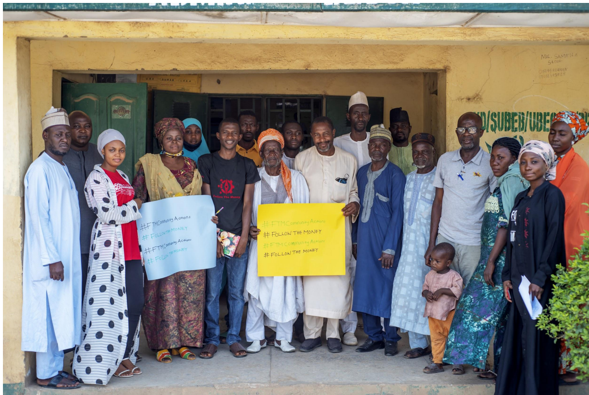
A group photograph of the Community Monitoring Team with Follow The Money champions

For an enhanced citizens engagement, we conducted community outreaches across 7 focus communities in 7 LGAs in Kaduna state and another 16 communities in the 3 senatorial zones in Kaduna state summing it up to 23 projects visited in 11 LGAs of Ungwan Rimi, Maraban Jos-Igabi, Danguzuri Makarfi, Kaura, Sabon Gari South, Kaduna North, Zaria, Zango Kataf/Jaba, Ikara, Jema'a/Sanga, Gidan Jatau Zango Kataf, the State to enlighten the members of the community about the various projects being nominated and budgeted in the National Budget yearly. The reports for this outreach were collated and analysed using a digitized community outreach reporting template. Find report here