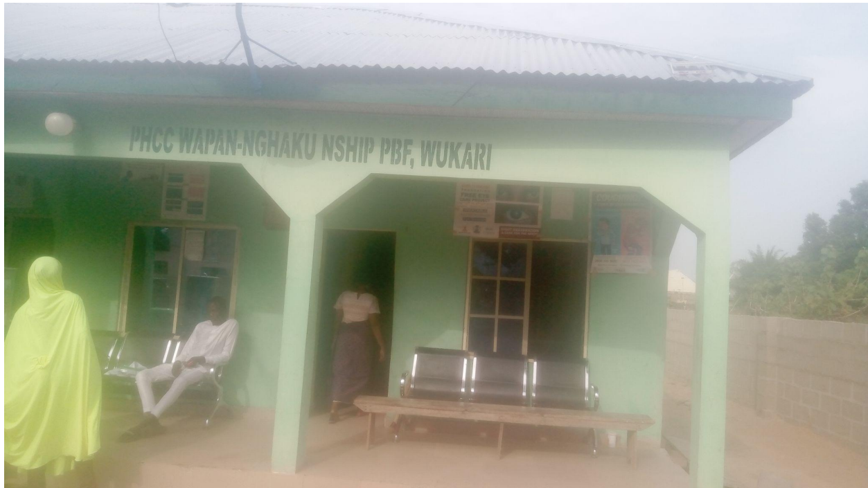
Wapan Nghanku Primary Health Care, Taraba South

As part of planned activities for the project, CODE through its social accountability initiative, Follow The Money, commenced the tracking of vaccine distribution, assessing the preparedness as well as the quality of Primary Healthcare Centres across the country to receive and administer the vaccines at the community level. Follow The Money champions across the 6 geopolitical zones (North central, North East, North West, South South, South East, South West) of Nigeria in 15 states – Cross River, Yobe, Bauchi, Gombe, Taraba, Abia, Anambra, Imo, Ebonyi, Benue, Kogi, Nasarawa, Plateau, Kebbi and Osun assessed the readiness of 90 PHCs to receive, store and effectively administer vaccines with the purpose to equally drive quality standardisation of PHCs in Nigeria.