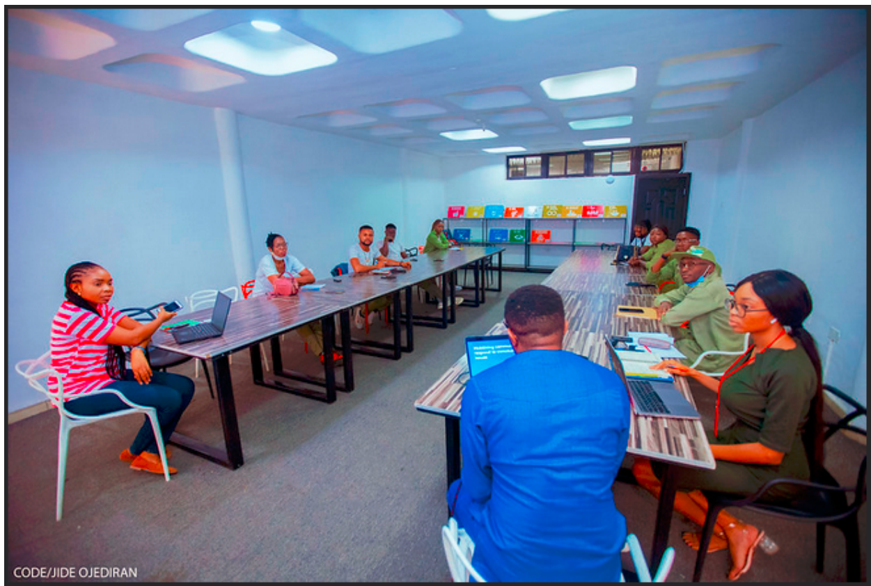
Cross-section of corp members with CODE-team during an on-boarding meeting on the PVP-project in Abuja

Also, we held an inception meeting with 6 selected corps members of the EFCC-Community Development Service group at Community Park and built their capacity to establish, coordinate and provide oversight on integrity clubs in schools. During the engagement, an action plan was developed as a tool to guide the team's activities and meet deliverables within deadlines. We developed Synopsis for radio engagement for the project states and also drafted the snippet of the Petroleum Industry Bill (PIB) from which a graphics representation of CODEs position was illustrated.