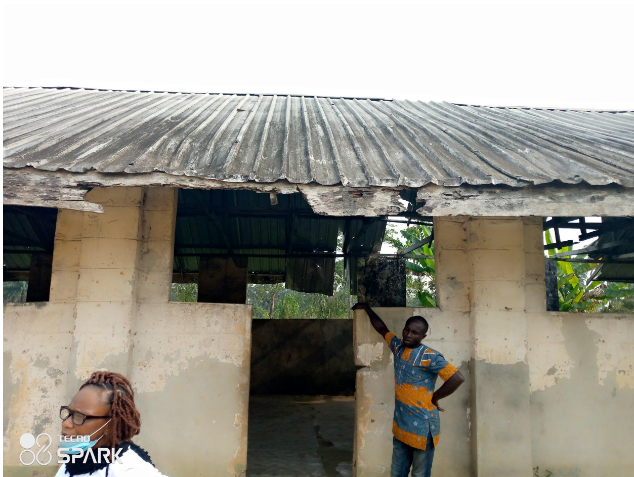
Picture of Odienmerenyi Primary School Old Structure in Odienmerenyi Community, Ahoada East, Rivers State currently in use

CODE is particularly keen on the use of data in policy influencing, this we have continued to do even with the project 'Empowering Oil-rich Community' with support from Ford Foundation. We were able to carry-out an analysis of the Rivers state budget from 2018-2020. The budget trend in the Education, Health, WASH and Environment sectors in the state within this period was also analysed, extracting the total amount budgeted for the mentioned sectors in 3 years.