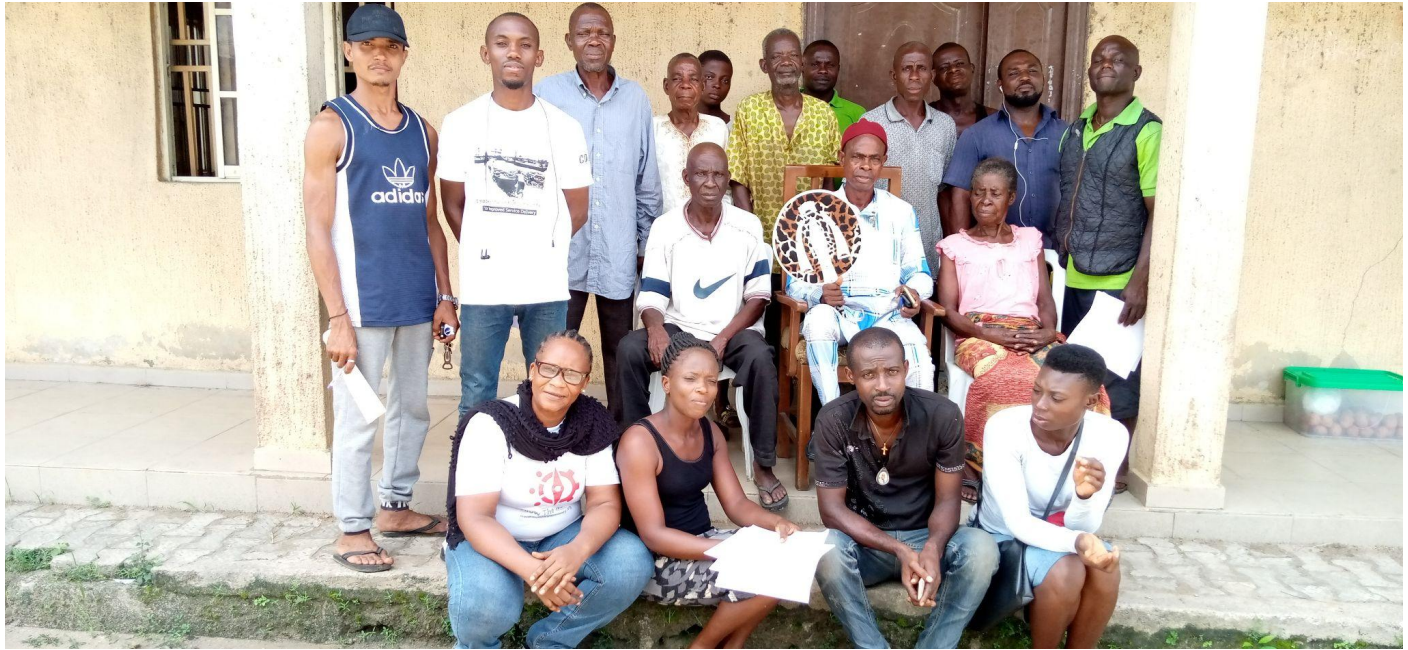
Follow The Money Champions during a visit to Ekpena Community in River State