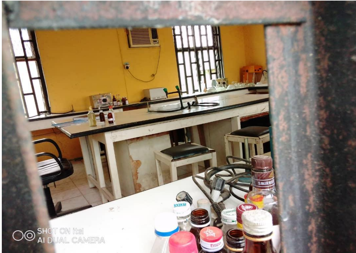
After- The current state of the laboratory in July, 2021 as a result of CODEs advocacy in Akwa Ibom