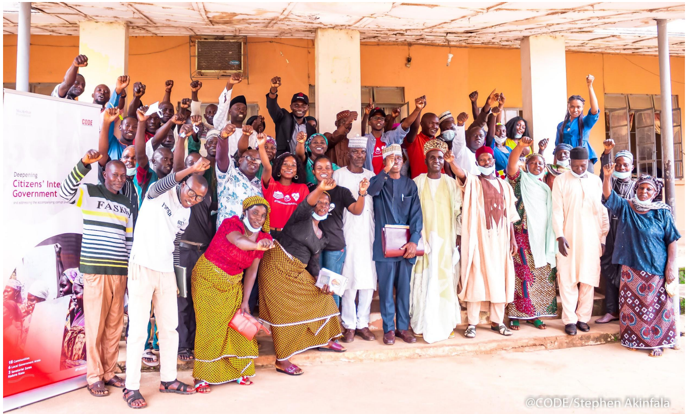
A group photograph of participants during the town hall meeting on the implementation of constituency projects in Kaduna South

Connected Development (CODE), with support from the John D. and Catherine T. MacArthur Foundation, commenced the DeSPAAC 2.0 project which stands for 'Deepening Citizens Interest in Government's Spendings and Addressing Accompanying Corrupt Practices Project Phase 2 in Kaduna State. This project is a year-long project aimed at increasing citizens' interests in government spendings and expenditures around constituency projects across the State. The project is geared towards tracking and monitoring government projects in 18 communities across the three senatorial districts in the State namely; Kaduna North, Kaduna South and Kaduna Central. The DeSPAAC campaign has helped in the implementation of projects in areas of Health, Education, Wash, and Environment in Kaduna State.