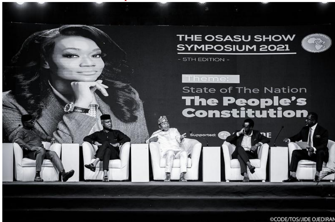
Panel of media, leadership and civil society analysing the process of a constitutional review and the role of the National Assembly in the Constitution amendment process

Recognizing the role of collaboration within the civic space, CODE partnered with The Osasu Show to host the 6th edition of The Osasu Show Symposium 2021.