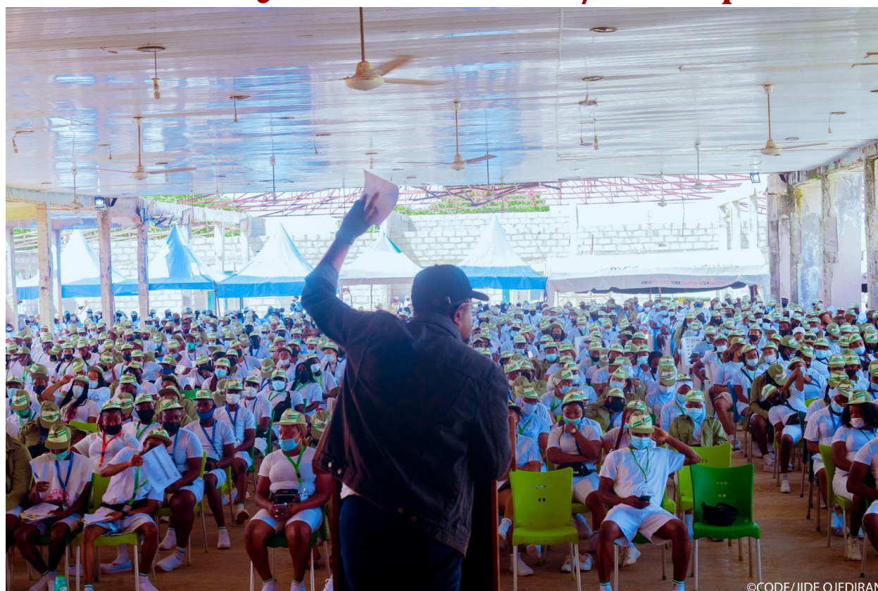
Sensitization of NYSC members in Abuja