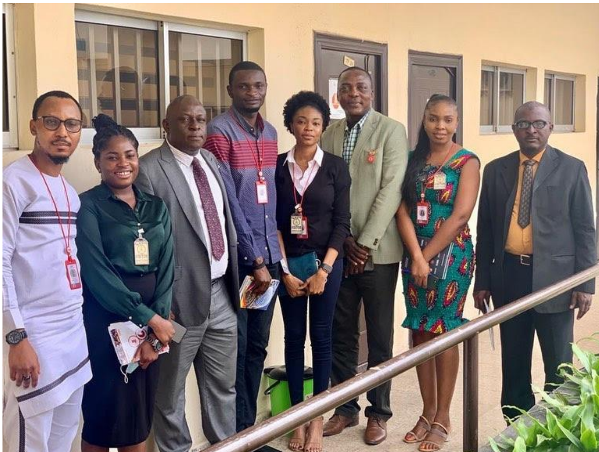
Delegates from CODE and Principal Officials of the ICPC's Education & Enlightenment Unit

CODE met with principal officers of the Independent Corrupt Practices Commission and Other Related Offences Commission (ICPC) to advance discussions on a partnership to raise public