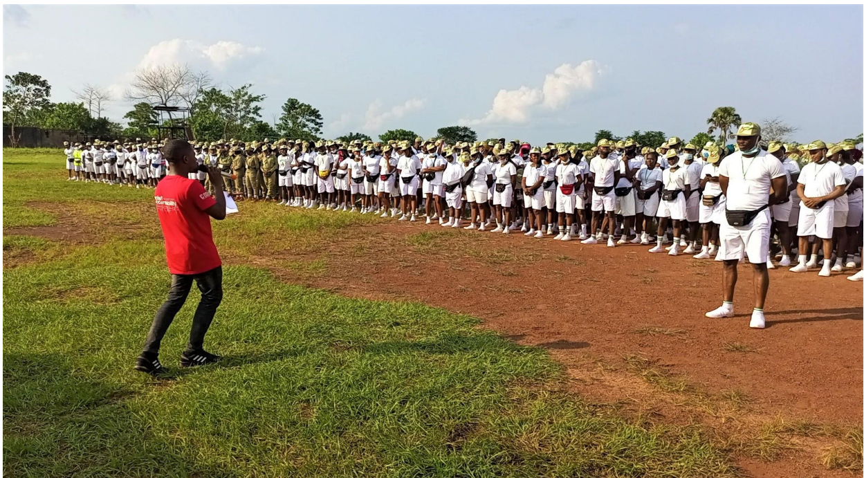
Sensitization of NYSC members on the power of civic engagement in demanding social accountability using FollowTheMoney model in Obubra, Cross River State

In a bid to create feedback loops between citizens/communities and the government by developing the capacity of citizens and communities to take part in public debates in order to hold their government accountable, CODE embarked on an advocacy visits to Independent Corruption Practices Commission (ICPC), National Orientation Agency (NOA) and Economic and Financial