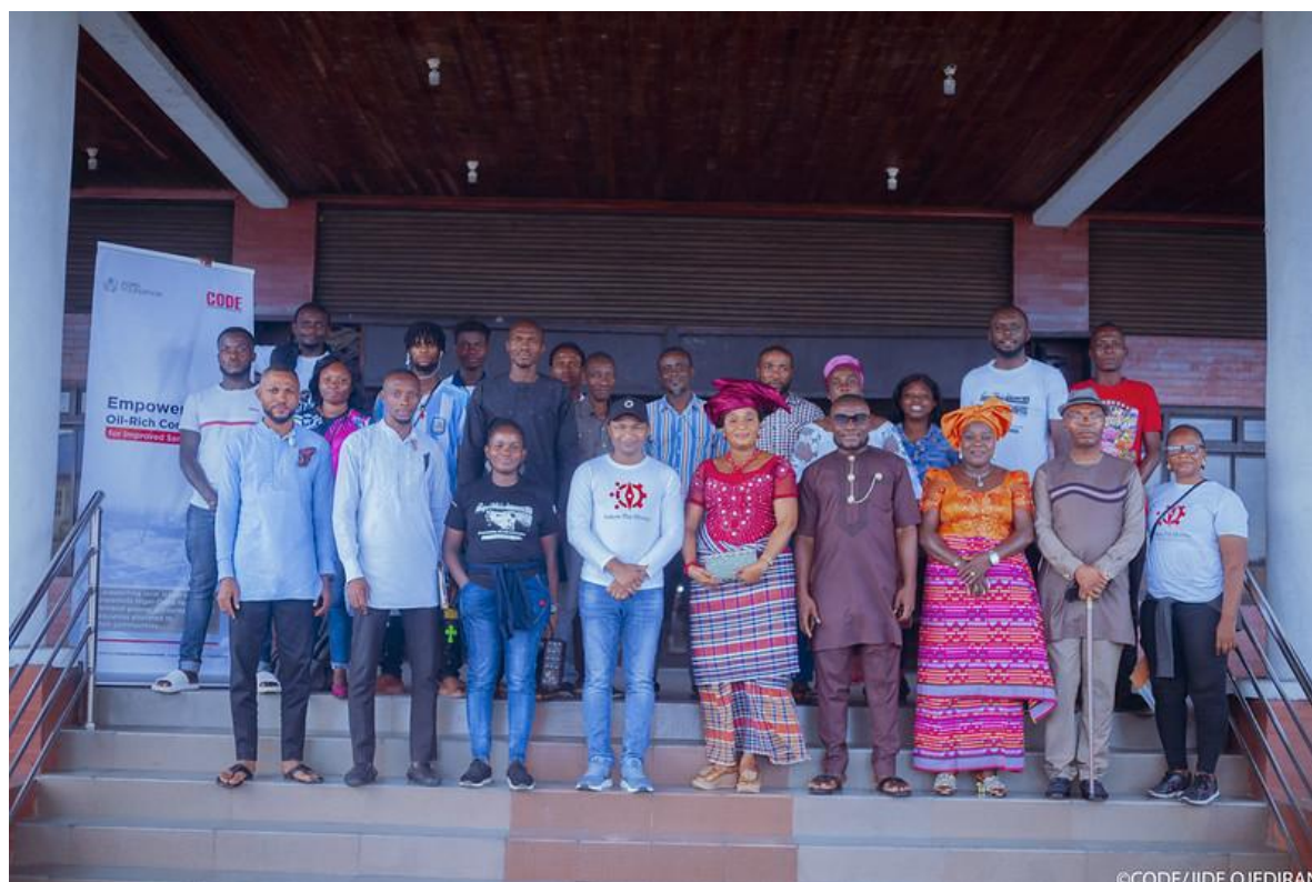
Group photograph with CODE and community stakeholders in Rivers State during the town hall meeting

Connected Development in partnership with Ford Foundation began the implementation of the project “Empowering Oil Rich Communities for Improved Service Delivery in Rivers State” . Leveraging on our expertise on community empowerment, multi-stakeholder dialogues’ platform facilitation, multidimensional advocacy, grassroots community engagement and using the instrumentality of its FollowTheMoney model, CODE through this project supported rural development in 10 communities namely Ogoni, Ahoada East, Ahoada West, Onelga, Oyigbo, Eleme Onne, Abonnema, Bonny, Etche, Emohua in Rivers State who have suffered severe environmental damage and loss of livelihoods as a result of oil exploration.