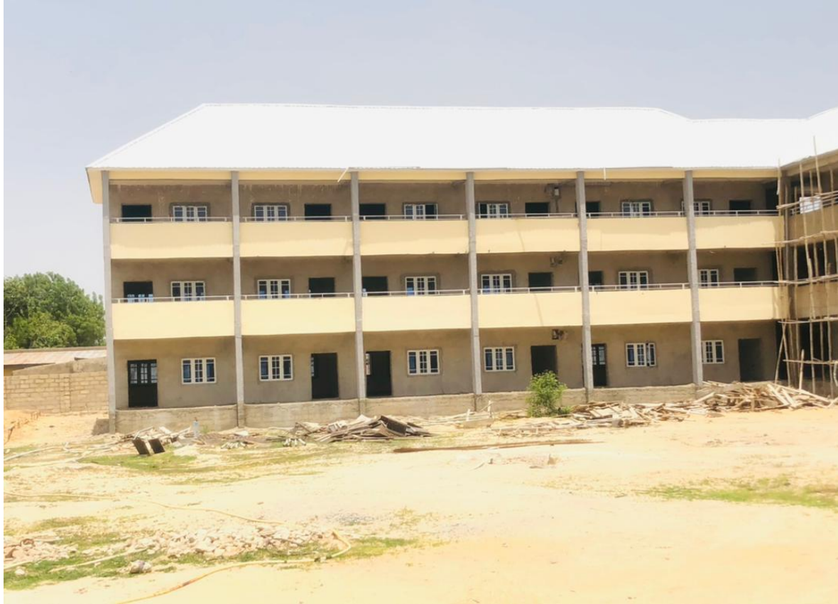
The Mega School project in Old Maiduguri, Borno State, at 90% completion