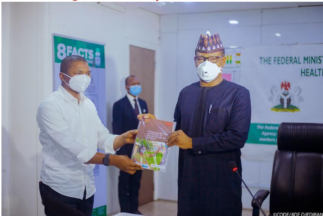
CEO CODE presenting the report on the State of PHCs and vaccine distribution to the ED/CEO NPHCDA